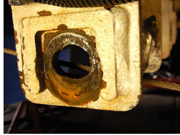
FIGURE 2: Loss of clamp/insufficient torque in shock bolts damage the mounts.