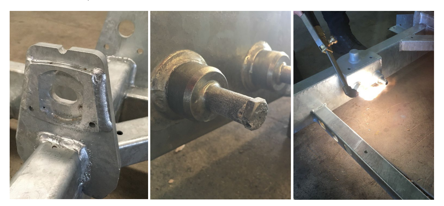
FIGURE 3: Buildup of gal coating on suspension mounts cleaned using heat

All chassis surfaces used in bolted connections that require to be torqued MUST be cleaned of excessive coating prior to component assembly. It is recommended that all bolted connections on new assemblies are torque checked after the first 300km and then after 1000km.